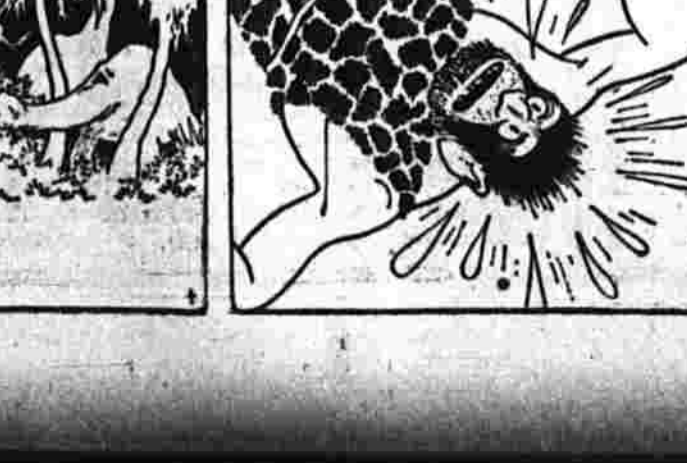
A Rather Grim Joke